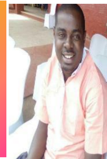
KENE NOME NATIONAL PROVOST